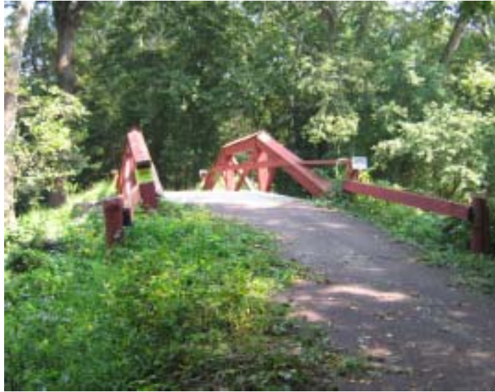
The "New Paths to Travel" trail leads to the tilted Thompson Neely Camelback Bridge.

The floods and a new trail project have brought another authentic camelback bridge to the top of the Friends' restoration list. The April and June floods affected the bridge that connects the Canal towpath with the Thompson Neely House property in the northern section of Washington Crossing Historic Park. The structure was lifted by the floodwaters and is now askew. The trusses are tilted and the lower sway braces are gone. Since the components of a camelback bridge work together to provide the bridge's strength and stability, structural repairs must be undertaken soon or the alignment problems will worsen and the bridge will have to be closed.