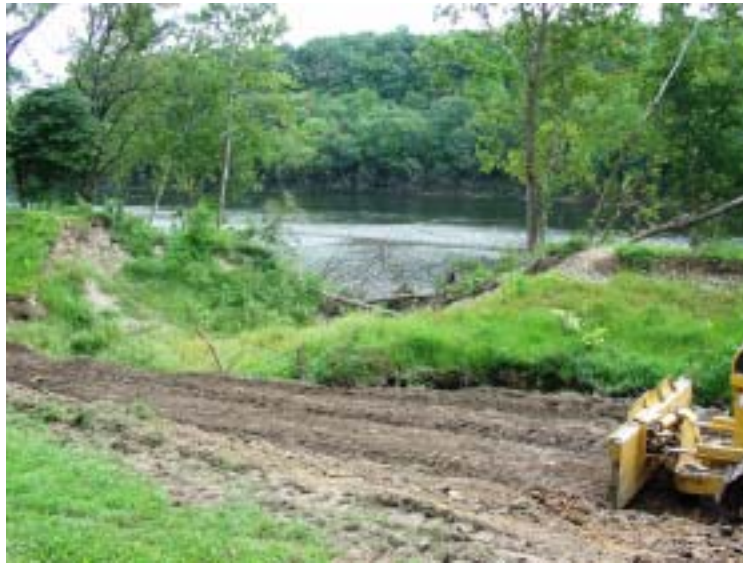
The towpath bank break south of Easton is creeping into the neighbor's lawn.